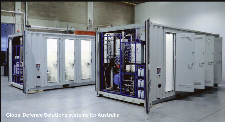
Global Defence Solutions systems for Australia