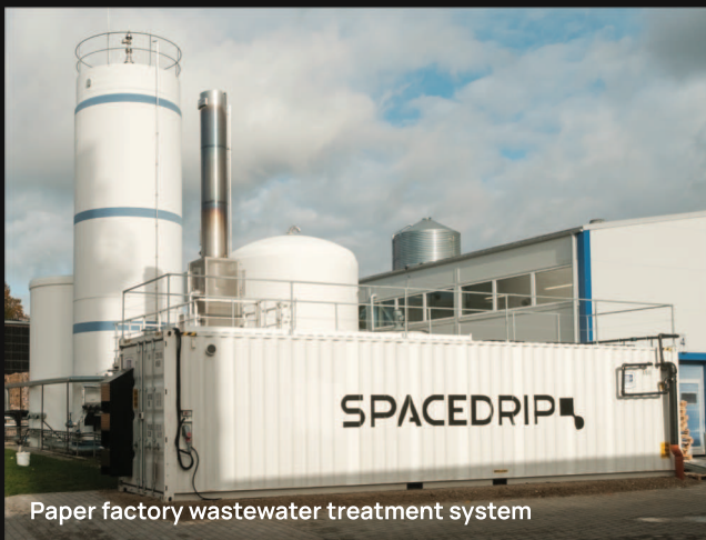
Paper factory wastewater treatment system