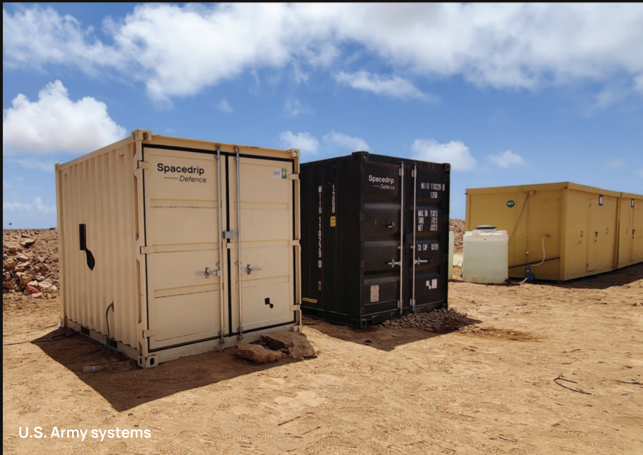
U.S. Army systems